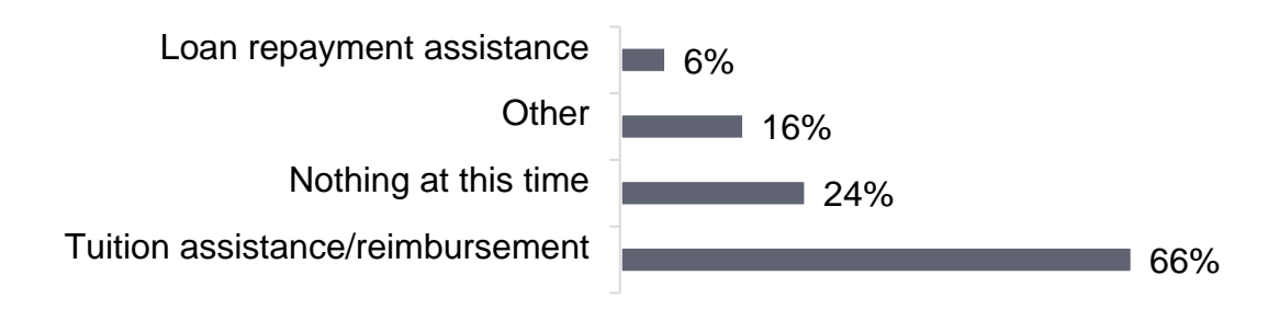
Figure 1. Survey Question: "Does your organization currently offer employees any educational assistance programs? (Select all that apply)."

Respondents were largely familiar with employer-sponsored student loan repayment programs; 63% (43) said they were at least somewhat familiar.